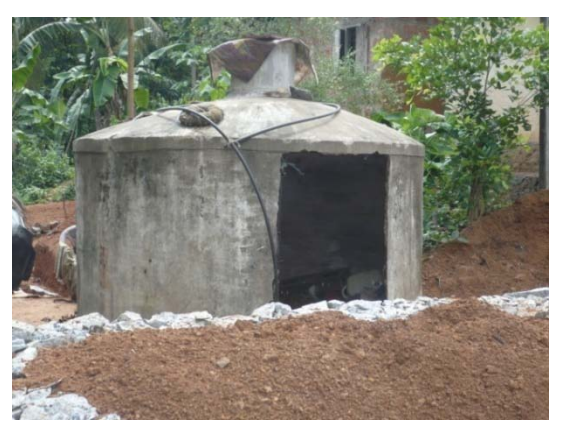
Figure 3.1: Abandoned Rain Water Harvesting Structure, Peruvampadam ST Colony

The Guidelines of KRWSA stipulated that RWHS<sup>30</sup> as a technology option for WSS should be resorted to only if all other options were found costly and not feasible. It required that the beneficiaries should be living in isolated, scattered and quality affected habitations facing acute scarcity where water no conventional water supply systems were feasible. However, Audit noticed that in Chaliyar GP, 70 and 90 numbers of RWHS